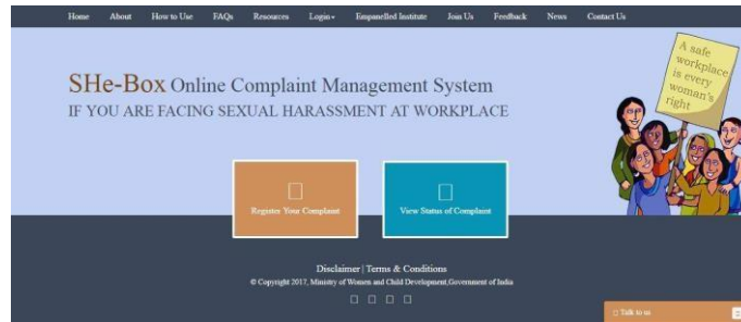
2 Fig.2: Portal of SHe-BOX

Users of SHe-BOX can also interact with Ministry of WCD through this portal. Aadhaar and valid email ID is necessary for registering of complaint [6].